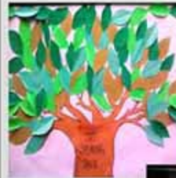
Earth Day - The Speaking Tree

Sarojini Naidu - 1st position Chand Bibi - 2nd position Madame Curie - 3rd position Nightingale - 4th position