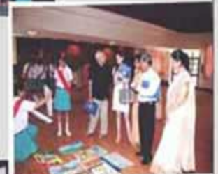
Moods 'n' Melodies