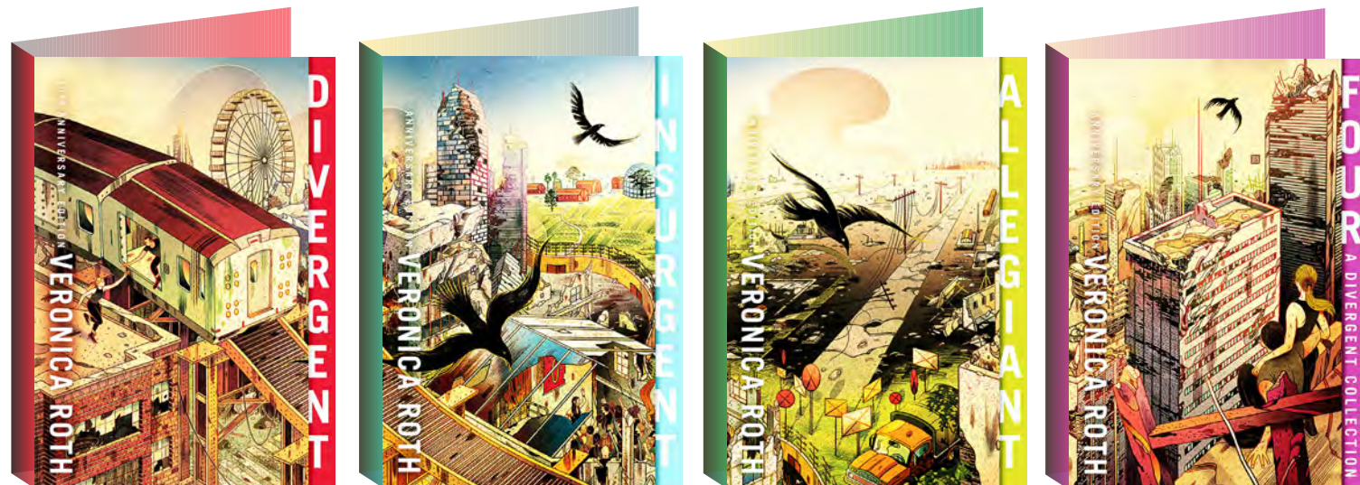
The 10th anniversary of the 'Divergent' series is being celebrated with the release of special editions of the trilogy.

? April 2021 marked the 10-year anniversary of 'Divergent's' release. How does that feel?