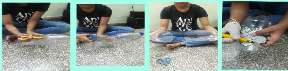
WALLHANGING USING PLASTIC BOTTLES