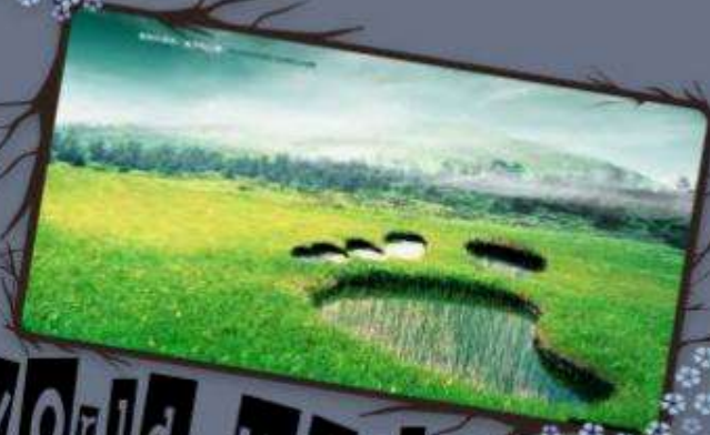
world wetlands day