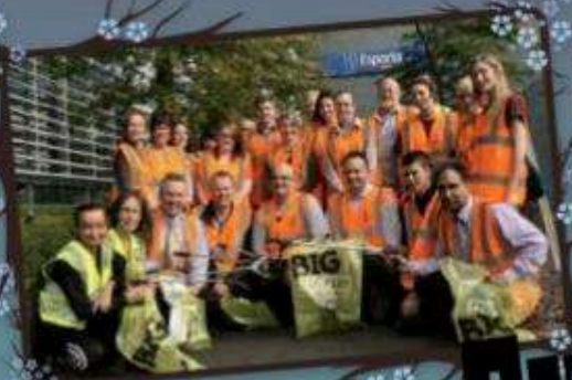
clean up day