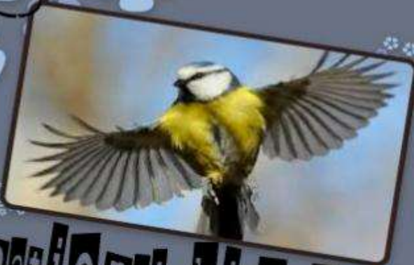
national bird day